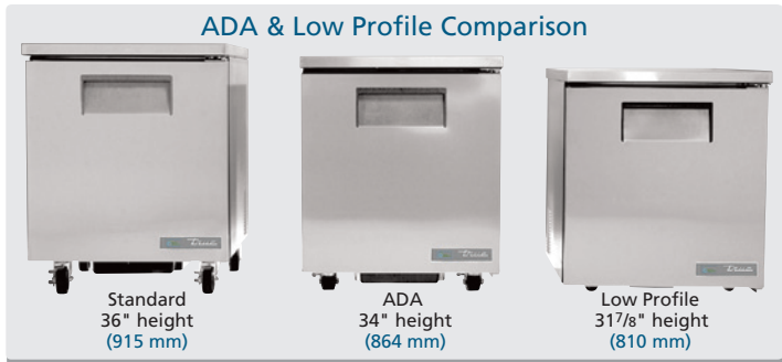
Standard 36" height (915 mm)