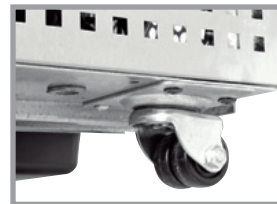
1 1/2" diameter dual swivel castors for "LP" models.