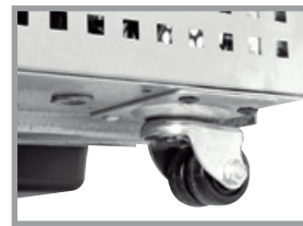
1 1/2" diameter dual swivel castors for "LP" models.