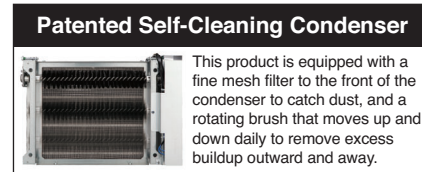
Patented Self-Cleaning Condenser

This product is equipped with a fine mesh filter to the front of the condenser to catch dust, and a rotating brush that moves up and down daily to remove excess buildup outward and away.