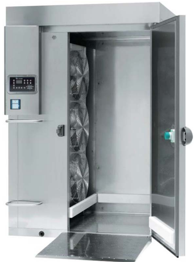
Shown with optional printer.