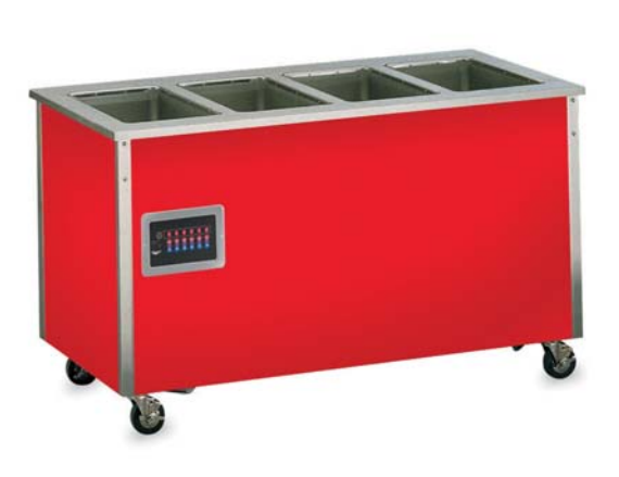
Signature Server<sup>®</sup> with Stainless Steel Counter 4 Well Hot Food Base