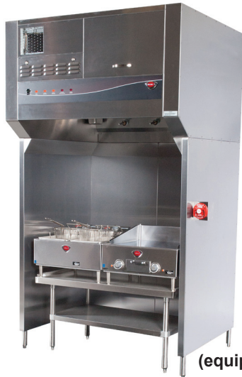
Model WVU-48 (equipment sold separately)