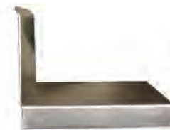
SM Series Backplash

96" long tables are standard with six legs.