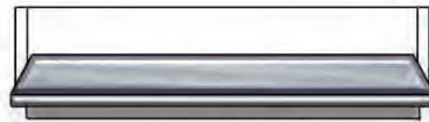
18" DEEP UNIT