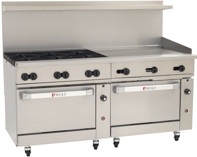
Model C72SS-6B-36G-N (shown with optional casters)

Connect-a-Range shipped in multiple cartons