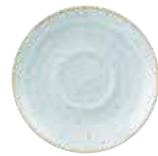
SAUCER SDESSS1 15.6cm 6 1/4" CTN QTY 12 (Fits SDESCB441, SDESCB401 SDESCB281 & SDESCB201)