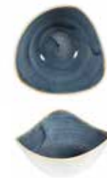
TRIANGLE BOWL SBBSTRB61 15.3cm 6" 26cl 9oz CTN QTY 12