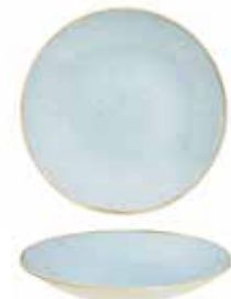
DEEP COUPE PLATE SDESPD251 25.5cm 10" H: 3.5cm CTN QTY 12 ✦