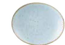
OVAL COUPE PLATE SDESOP7 1 19.2cm 7 3/4" CTN QTY 12 ✦