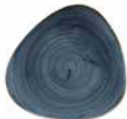
TRIANGLE PLATE SBBSTR9 1 22.9cm 9" CTN QTY 12 SBBSTR7 1 19.2cm 7¾" CTN QTY 12