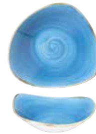
TRIANGLE BOWL SCFSTRB91 23.5cm 9¼" 60cl 21oz SCFSTRB71 18.5cm 7¼" 37cl 13oz CTN QTY 12