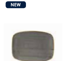
NEW PEPPERCORN GREY CHEFS' OBLONG PLATE No. 8 SPGSOBL141 30 x 19.9cm CTN QTY 6 No. 7 SPGSOBL31 26.1 x 20.2cm CTN QTY 12 No. 6 SPGSOBL21 23.7 x 15.7cm CTN QTY 12 No. 5 SPGSOBL11 15.4 x 12.6cm CTN QTY 12