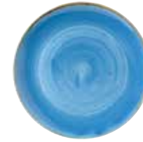
COUPE BOWL SCFSEVB91 24.8cm 9¾" 113.6cl 40oz CTN QTY 12