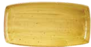
OBLONG PLATE SMSOP141 35 x 18.5cm 14" x 7¼" CTN QTY 6