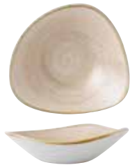
TRIANGLE BOWL SNMSTRB91 23.5cm 9¼" 60cl 21oz CTN QTY 12