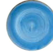
COUPE BOWL SCFSEVB71 18.2cm 7¼" 42.6cl 15oz CTN QTY 12