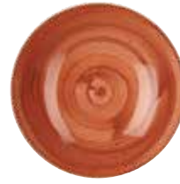
COUPE BOWL SSOSEVB91 24.8cm 9¾" 113.6cl 40oz CTN QTY 12 SSOSEVB71 18.2cm 7¼" 42.6cl 15oz CTN QTY 12