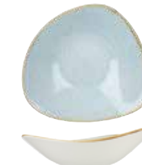
TRIANGLE BOWL SDESTRB91 23.5cm 9 1/4" 60cl 21oz SDESTRB71 18.5cm 7 1/4" 37cl 13oz SDESTRB61 15.3cm 6" 26cl 9oz CTN QTY 12