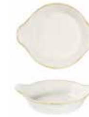
BARLEY WHITE LARGE ROUND EARED DISH SWHSLREN1 17.5 x 21.5cm 7 x 8 1/2" 59cl 20.8oz CTN QTY 6 SWHSSREN1 15 x 18cm 5 7/8 x 7 1/8" 30cl 10.6oz CTN QTY 6