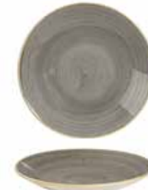
DEEP COUPE PLATE SPGSPD271 28.1cm 11" H: 3.7cm CTN QTY 12 ✦ SPGSPD251 25.5cm 10" H: 3.5cm CTN QTY 12 ✦ SPGSPD221 22.5cm 8 5/6" H: 2.7cm CTN QTY 12 ✦