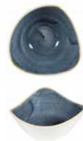
TRIANGLE BOWL SBBSTRB71 18.5cm 9¼" 37cl 13oz CTN QTY 12