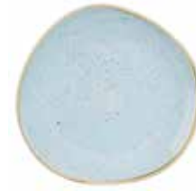
ORGANIC ROUND PLATE SDESOG111 28.6cm 11 1/4" SDESOG101 26.4cm 10 3/8" CTN QTY 12