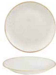
DEEP COUPE PLATE SWHSPD271 28.1cm 11" H: 3.7cm CTN QTY 12 + SWHSPD251 25.5cm 10" H: 3.5cm CTN QTY 12 + SWHSPD221 22.5cm 8 5 / 8 " H: 2.7cm CTN QTY 12 +