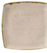
DEEP SQUARE PLATE SNMSDS101 26.8cm 10½" CTN QTY 6