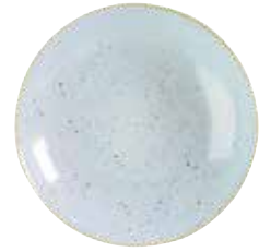
LARGE COUPE BOWL SDESPLC21 31cm 12" 240cl 84.5oz CTN QTY 6 ✦