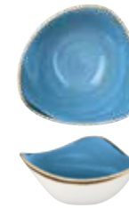
TRIANGLE BOWL SCFSTRB61 15.3cm 6" 26cl 9oz CTN QTY 12