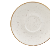
SAUCER SWHSCSS 1 15.6cm 6 1/4" CTN QTY 12 (Fits SWHSCB281, SWHSCB201 SWHSCB441 & SWHSCB401)