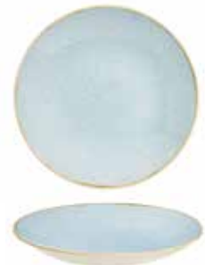
DEEP COUPE PLATE SDESPD271 28.1cm 11" H: 3.7cm CTN QTY 12 ✦