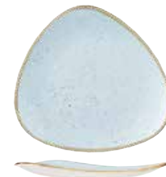
TRIANGLE PLATE SDESTR121 31.1cm 12 1/4" CTN QTY 6 ✦ SDESTR101 26.5cm 10 1/2" CTN QTY 12