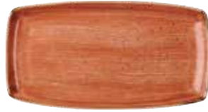
OBLONG PLATE SSOSOP141 35 x 18.5cm 14" x 7¼" CTN QTY 6 SSOSOP111 29.5 x 15cm 11¾" x 6" CTN QTY 12