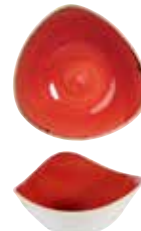
TRIANGLE BOWL SBRSTRB71 18.5cm 9¼" 37cl 13oz CTN QTY 12 SBRSTRB61 15.3cm 6" 26cl 9oz CTN QTY 12