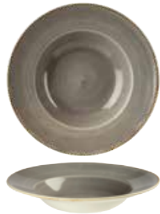
WIDE RIM BOWL SPGSVWB1 28cm 11" 46.8cl 16.5oz CTN QTY 12 ✦ SPGSVWB1 24cm 9 1/2" 28.4cl 10oz CTN QTY 12 ✦