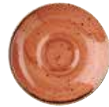
ESPRESSO SAUCER SSOSSESS 1 11.8cm 4½" CTN QTY 12 (Fits SSOSCEB91)