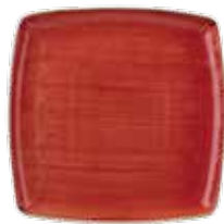
DEEP SQUARE PLATE SBRSDS101 26.8cm 10½" CTN QTY 6