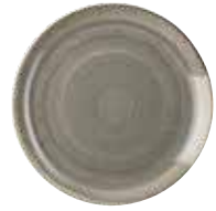
COUPE PLATE SPGSEVP81 21.7cm 8 2/3" CTN QTY 12 ✦ SPGSEVP61 16.5cm 6 1/2" CTN QTY 12 ✦