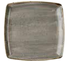
DEEP SQUARE PLATE SPGSDS101 26.8cm 10 1/2" CTN QTY 6