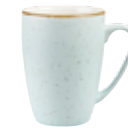
MUG SDESVM121 34cl 12oz H: 11cm Dia: 8cm CTN QTY 12