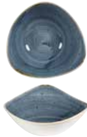
TRIANGLE BOWL SBBSTRB91 23.5cm 9¼" 60cl 21oz CTN QTY 12