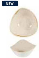
TRIANGLE BOWL SNMSTRB71 18.5cm 9¼" 37cl 13oz CTN QTY 12 SNMSTRB61 15.3cm 6" 26cl 9oz CTN QTY 12