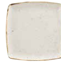
DEEP SQUARE PLATE SWHSDS101 26.8cm 10 1 / 2 " CTN QTY 6