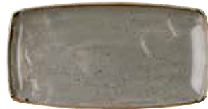
OBLONG PLATE SPGSOP141 35 x 18.5cm 14" x 7 1/4" CTN QTY 6 SPGSOP111 29.5 x 15cm 11 3/4" x 6" CTN QTY 12