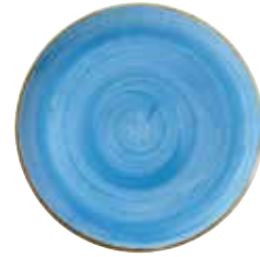
COUPE PLATE SCFSEV111 28.8cm 11¼" CTN QTY 12 SCFSEV101 26cm 10¼" CTN QTY 12