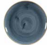
COUPE PLATE SBBSEVP61 16.5cm 6½" CTN QTY 12 ✦