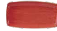
OBLONG PLATE SBR SOP111 29.5 x 15cm 11¾" x 6" CTN QTY 12