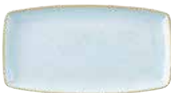
OBLONG PLATE SDESOP141 35 x 18.5cm 14" x 7 1/4" CTN QTY 6 ✦ SDESOP111 29.5 x 15cm 11 3/4" x 6" CTN QTY 12