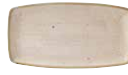
OBLONG PLATE SNMSOP111 29.5 x 15cm 11¾" x 6" CTN QTY 12