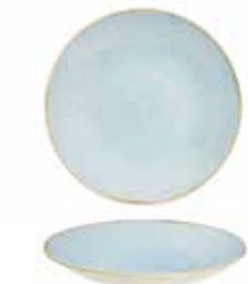
DEEP COUPE PLATE SDESPD221 22.5cm 8 5/8" H: 2.7cm CTN QTY 12 ✦