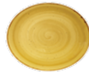
OVAL COUPE PLATE SMSOP7 1 19.2cm 7¾" CTN QTY 12 ✦