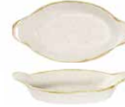
BARLEY WHITE INTERMEDIATE OVAL EARED DISH SWHSIOEN1 23.2 x 12.5cm 9 1/8 x 5" 38cl 13.4oz CTN QTY 6 SWHSSOEN1 20.5 x 11.3cm 8 1/8 x 4 5/8" 25.5cl 9oz CTN QTY 6