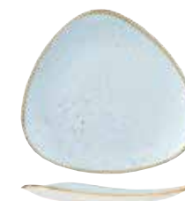
TRIANGLE PLATE SDESTR9 1 22.9cm 9" CTN QTY 12 ✦ SDESTR7 1 19.2cm 7 3/4" CTN QTY 12