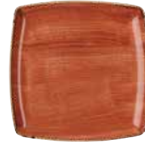
DEEP SQUARE PLATE SSOSDS101 26.8cm 10½" CTN QTY 6