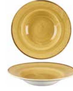
WIDE RIM BOWL SMSVWBL1 28cm 11" 46.8cl 16.5oz CTN QTY 12 ✦ SMSVWBM1 24cm 9½" 28.4cl 10oz CTN QTY 12 ✦