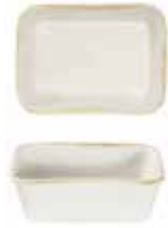
BARLEY WHITE LASAGNE DISH SWHSLASN1 16 x 12 x 5cm 6 1/8 x 4 3/4 x 2" 60cl 21.1oz CTN QTY 12