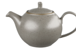
BEVERAGE POT SPGSSB151 42.6cl 15oz H: 10.5cm CTN QTY 4 REPLACEMENT LID SPGSRLL151 CTN QTY 6