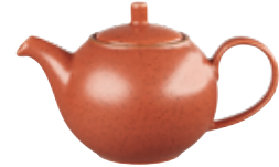
BEVERAGE POT SSOSSB151 42.6cl 15oz H: 10.5cm CTN QTY 4 REPLACEMENT LID SSOSRL151 CTN QTY 6