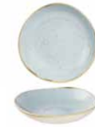
ORGANIC ROUND BOWL SDESOGB11 25.3cm 9 3/4" 110cl 38oz CTN QTY 12