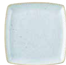
DEEP SQUARE PLATE SDESDS101 26.8cm 10 1/2" CTN QTY 6