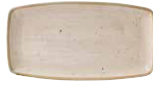
OBLONG PLATE SNMSOP141 35 x 18.5cm 14" x 7¼" CTN QTY 6