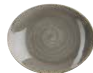
OVAL COUPE PLATE SPGSOP7 1 19.2cm 7 3/4" CTN QTY 12 ✦