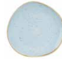
ORGANIC ROUND PLATE SDESOG8 1 21cm 8 1/4" SDESOG7 1 18.6cm 7 1/4" CTN QTY 12