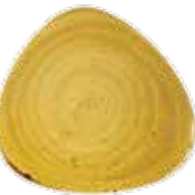
TRIANGLE PLATE SMSSTR7 1 19.2cm 7¾" CTN QTY 12