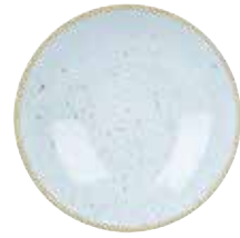
COUPE BOWL SDESEVB91 24.8cm 9 3/4" 113.6cl 40oz CTN QTY 12 ✦ SDESEVB71 18.2cm 7 1/4" 42.6cl 15oz CTN QTY 12 ✦