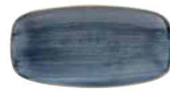
CHEFS' OBLONG PLATE No. 3 SBBSXO111 29.8 x 15.3cm 11 ¾" x 6" CTN QTY 12