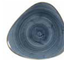
TRIANGLE PLATE SBBSTR121 31.1cm 12¼" CTN QTY 6