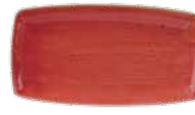
OBLONG PLATE SBR SOP141 35 x 18.5cm 14" x 7¼" CTN QTY 6