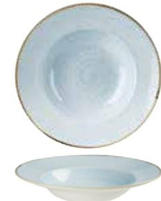
WIDE RIM BOWL SDESVWBL1 28cm 11" 46.8cl 16.5oz CTN QTY 12 ✦ SDESVWBM1 24cm 9 1/2" 28.4cl 10oz CTN QTY 12 ✦