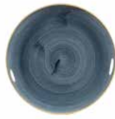
COUPE PLATE SBBSEV101 26cm 10¼" CTN QTY 12 ✦