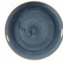
COUPE PLATE SBBSEVP81 21.7cm 8⅔" CTN QTY 12 ✦