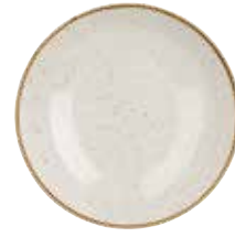
COUPE BOWL SWHSEVB91 24.8cm 9 3 / 4 " 113.6cl 40oz CTN QTY 12 + SWHSEVB71 18.2cm 7 1 / 4 " 42.6cl 15oz CTN QTY 12 +