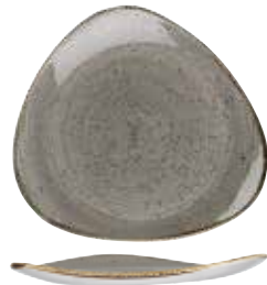
TRIANGLE PLATE SPGSTR121 31.1cm 12 1/4" CTN QTY 6 SPGSTR101 26.5cm 10 1/2" CTN QTY 12 SPGSTR9 1 22.9cm 9" CTN QTY 12 SPGSTR7 1 19.2cm 7 3/4" CTN QTY 12