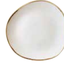
ORGANIC ROUND PLATE SWHSOG111 28.6cm 11 1 / 2 " SWHSOG101 26.4cm 10 3 / 8 " CTN QTY 12