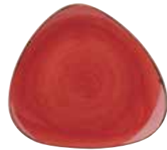
TRIANGLE PLATE SBRSTR121 31.1cm 12¼" CTN QTY 6 SBRSTR101 26.5cm 10½" CTN QTY 12