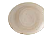
OVAL COUPE PLATE SNMSOP71 19.2cm 7¾" CTN QTY 12